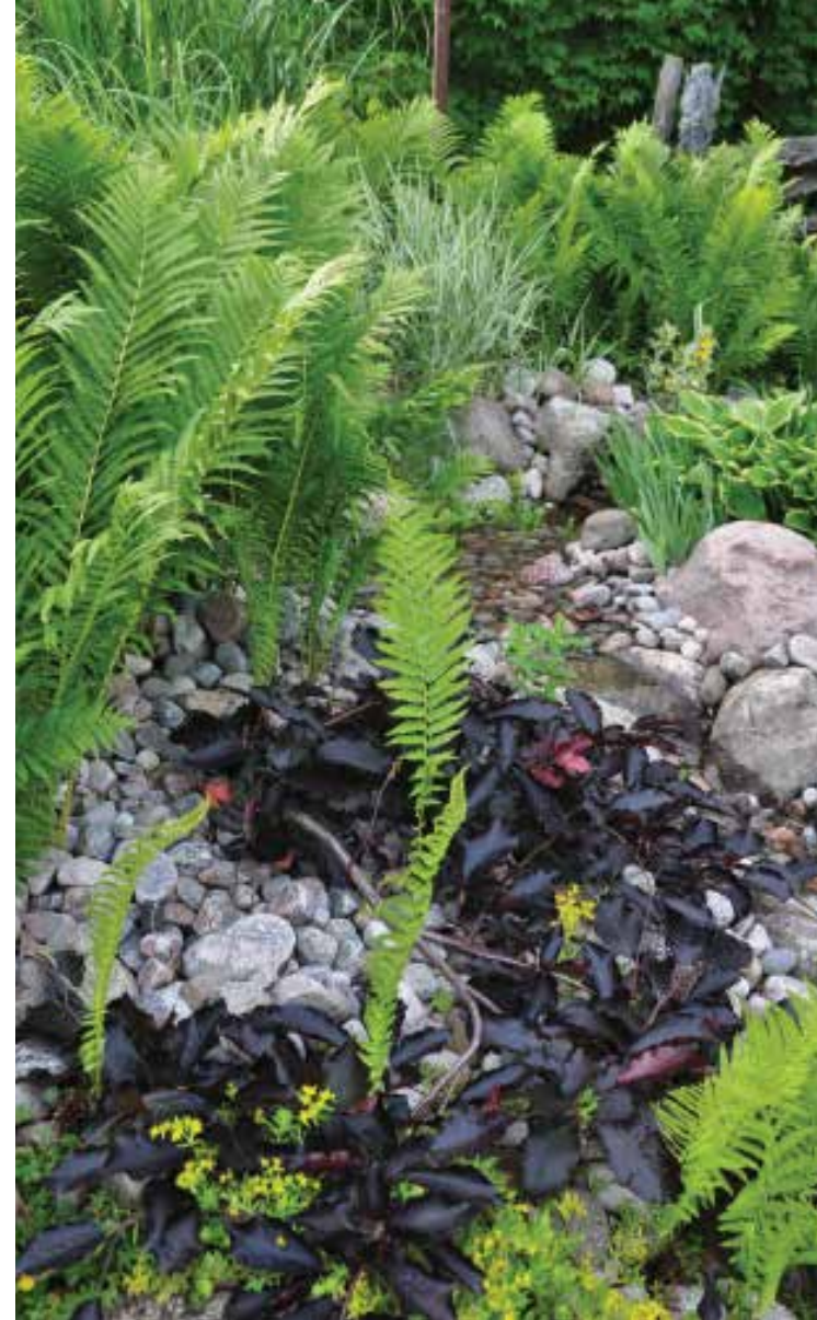
▲ Beneath some native Ostrich ferns, Matteuccia struthiopteris , striking new shoots of a Copper Beech trail across the ground. The tree appeared to have died, so was cut down.