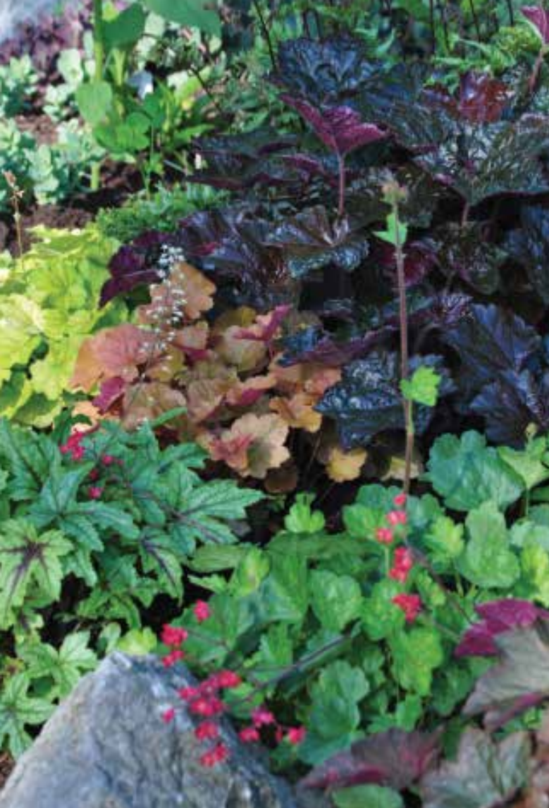
▲ Heuchera or coral bells with leaves in shades of peach, burgundy, green and rose grow in a flowerbed near the driveway.