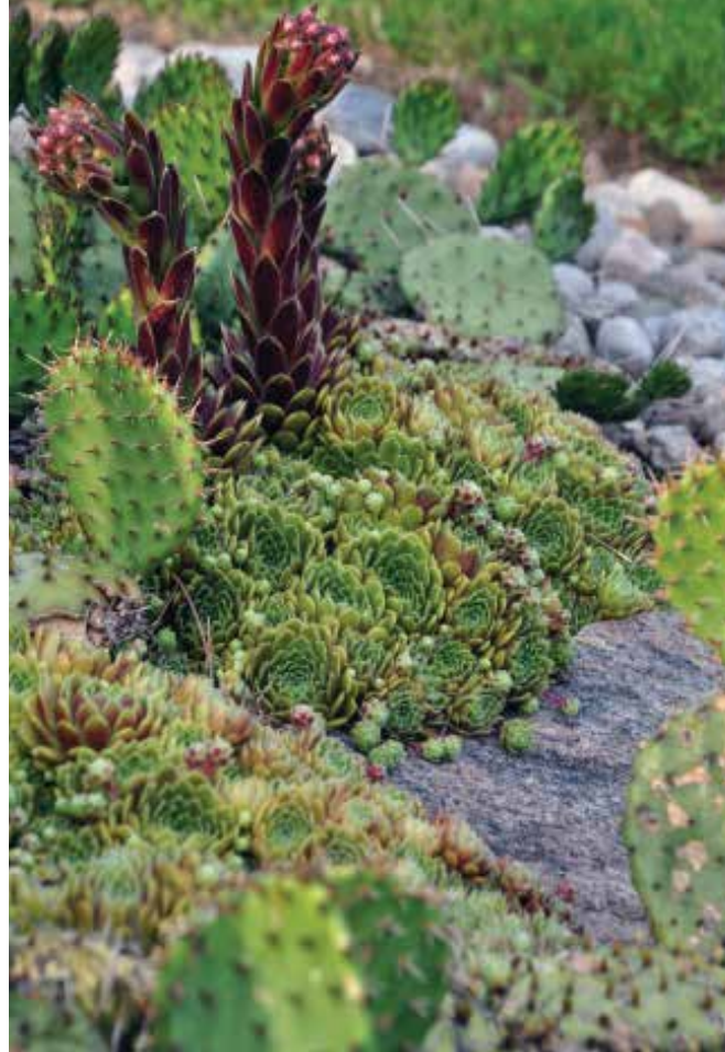
▲ A garden of hardy cacti surprises visitors. These can overwinter outdoors and produce beautiful flowers.