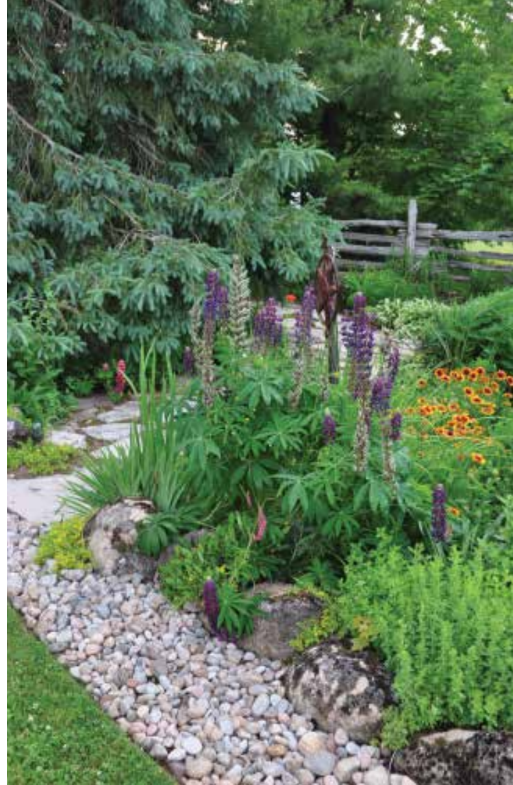
▲ Deep purple, pink and white Lupins self-seed in the large flower bed, sometimes being transplanted to better locations.