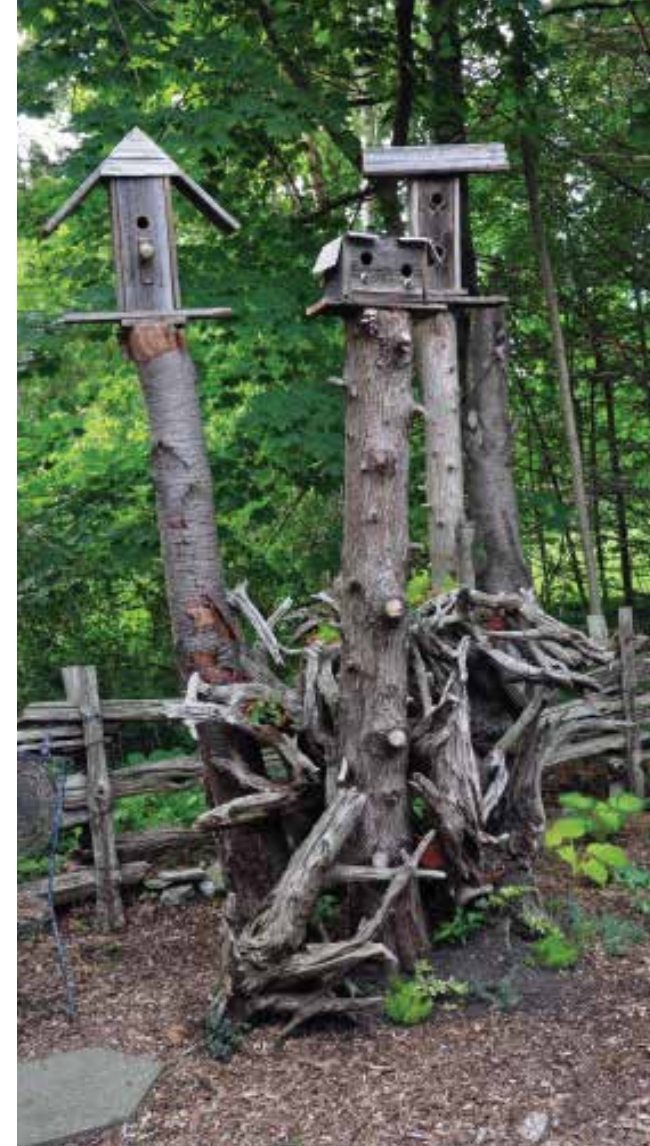
▲ Mary-Anne grouped tree roots to create a stumpery, tucking in potted plants where they can be held. Birdhouses throughout the garden result in plenty of bird song.

the sides of the rustic timber and provides a leafy canopy, which is a welcome respite from the sun on a hot day. A pea gravel path guides the visitor under the arbor to the pond and through the adjacent flowerbeds.