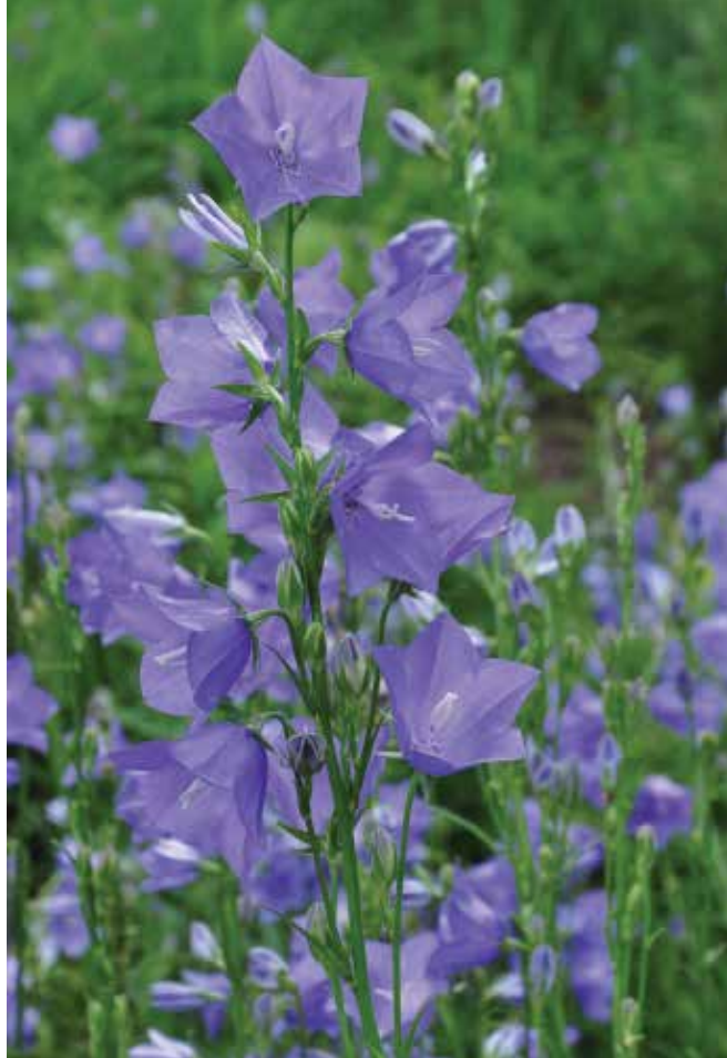
▲ Campanula or bellflowers glow in the sunlight.