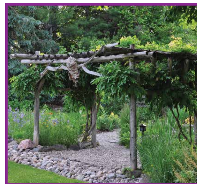
▲ Wisteria winds up the sides of the rustic arbor that Mary-Anne designed and installed herself. A pea gravel path beckons the visitor through the arbor and along the pond and flowerbeds.

One might easily imagine that an entire crew of landscape professionals is responsible, but it's Mary-Anne alone who cares for the garden.